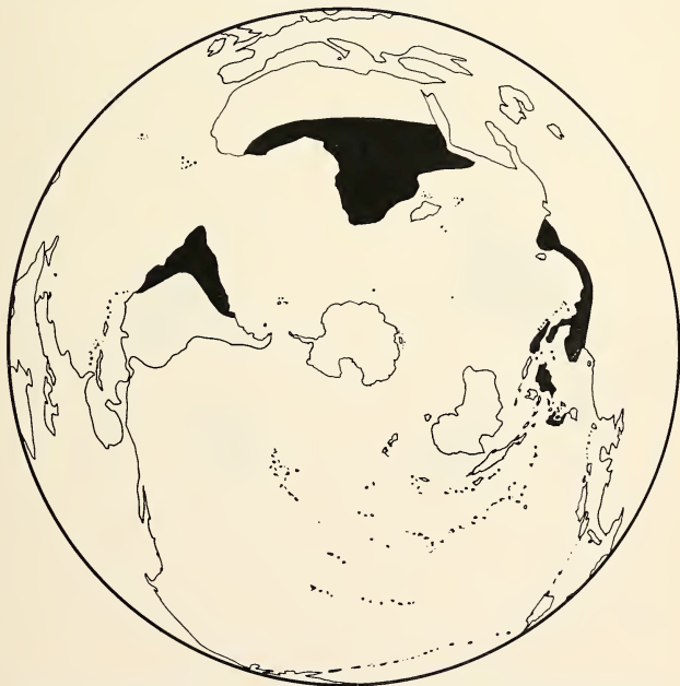
Fig. 9. Distribution of the living members of the family Bufonidae (except Bufo ).

Leptodactylidae. This is another large family with hundreds of species. The geographic range covers South and Central America